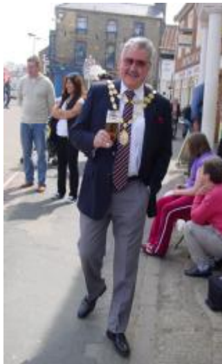
The Town Mayor enjoys the sunshine

We continue to market Pocklington and the Promote Pocklington Group have produced an