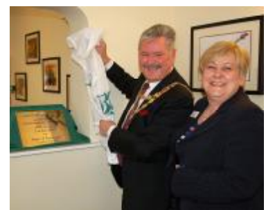
Right: The Town Mayor opens new care facilities at Beaumont House, Stamford Bridge.