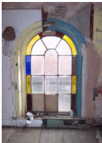
Left: One of the original features of the Oak House to be retained

The first floor of the Oak House has undergone repair work to the beams and floorboards in preparation for this area to be brought back into use. A group of councillors, together with representatives from local groups and members of the public are considering the best use for this area after the refurbishment.