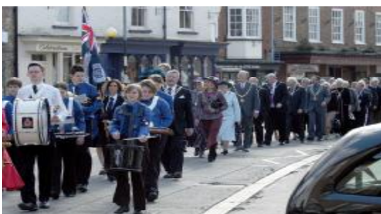
Left: The Civic Ceremony in March was organised by The Town Mayor

We celebrated St George's Day in Pocklington, to promote national pride, with entertainment provided by the Ebor Morris Dancers, a Junior Town Criers competition and a further competition between the pupils at Pocklington Junior School for the best poster for St George's Day. A splendid dragon was loaned to us made by the children from Pocklington Infants School.